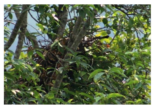
Figure 3. Nest of Jerdon's baza

Owing to its nature of being unperturbed to minor disturbances (also observed while photographing it as it perched on low branches and did not make quick responses or fly away while moving near on several accounts), this species seems vulnerable to hunting. Further, unintentional poisoning of the species by feeding on poisoned rats could pose threat to species as rat poisoning is common around. Therefore, along with habitat degradation and fragmentation, hunting and other activities like poisoning in potential prey could be threats to the conservation of the species. Such activities could pose