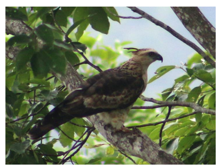
Figure 2. Jerdon's baza observed during the survey in llam

* The GPS coordinates of the nesting site have not been provided here considering the sensitiveness of the information. However, the author may provide the location in request of the researchers.