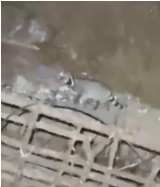
Figure 2. Large Indian civet exploring the rubbish on December 23 2023 at 05:44 PM, snapped photos from video footage.

On 4 November 2022 at 04:51 PM, a Siberian weasel was observed (28.210°E, 85.4816°N, 3,253 m asl) about 800 meters north of Ghodatabela area (Fig. 3). The area was shrubby, with dried grasses along the stone wall on the side of the trekking trail route to Langtang Valley. The weasel was beside a stone fence on the side of the trail, near a restaurant and an abandoned field with a stone fence. The weasel gazed for a minute, occasionally moving in response to ambient