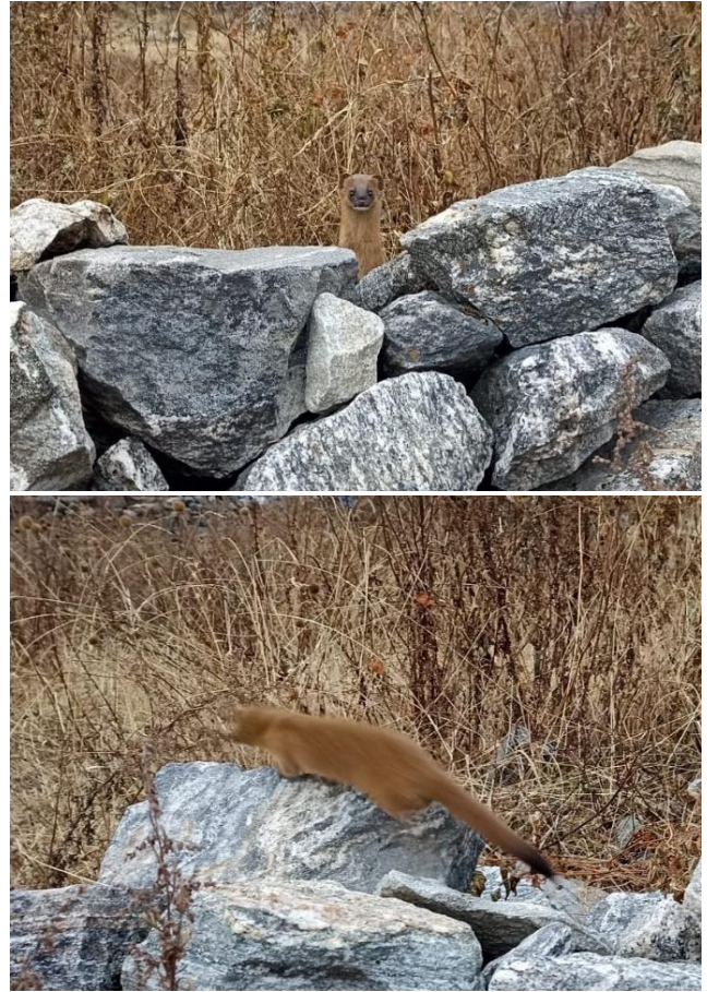
Figure 3. Siberian weasel wandering from stone fencing on November 4, 2022, at 04:51 PM and dark chocolate coloration on the snout, uniform body, and clear black tip, are identifiable characteristics of the species (Photo by: Bhumika Thapa).

sounds. The species was undisturbed and calm, even though the co-author was just 2 meters away.